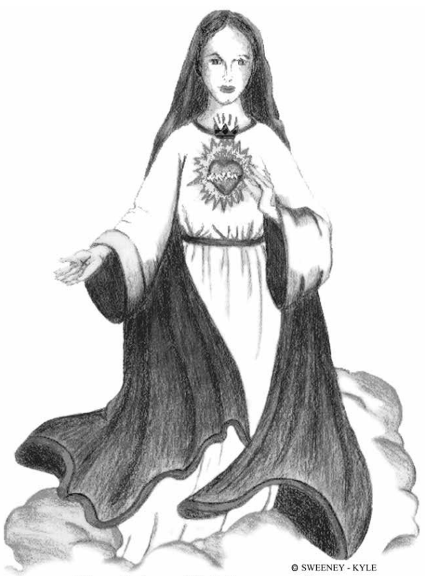
Mary, Refuge of Holy Love, pray for us.